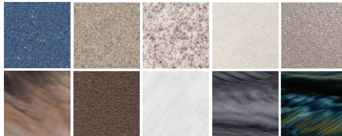
Left to right: Denim, Desert, Sahara, Gypsum, Linen, Tuscan Sun, Latte, Silver Marble, Storm Clouds and Midnight Canyon

Your Vita Spa is available in ten vibrant colors to complement the beauty of its design.